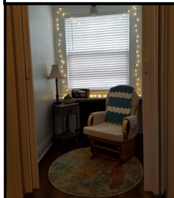
The Partnership's new Breastfeeding space!