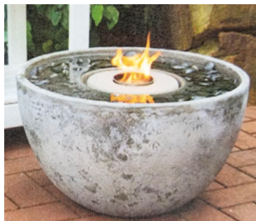
HOME & GARDEN