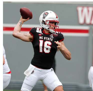
MEN'S & SPORTS