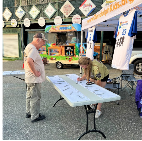
The auction tables where the bidding happened!