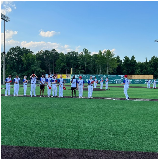
Our hometown Zookeepers in their custom jerseys just after the National Anthem was played by a violinist.