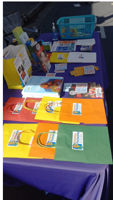
Resources at the Ready