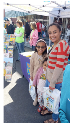
Whether books or resources there was something for everyone