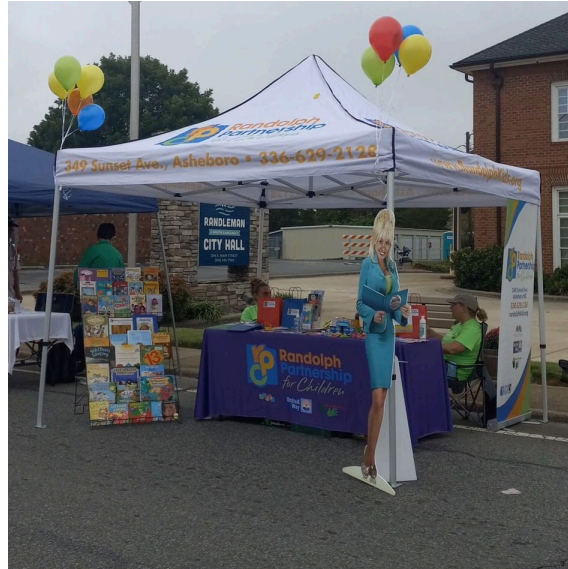
Set up and ready at Randleman Nascar Days

See below for the heartwarming moments and vibrant snapshots from these memorable days.