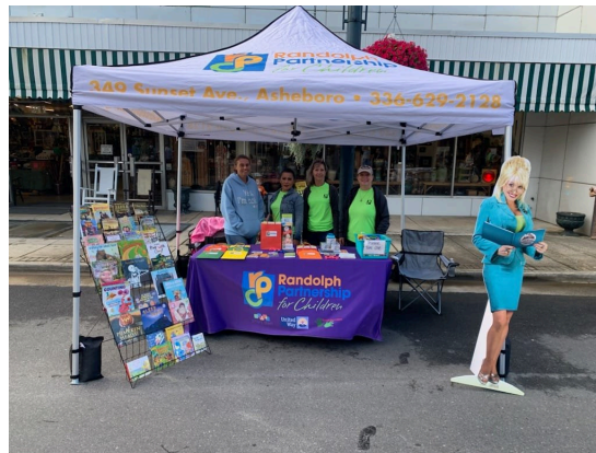
At the Asheboro Fall Festival

Together, we're building a stronger, more vibrant community for our little ones.